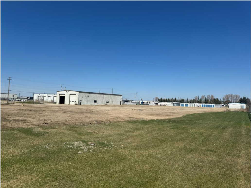
5903 44A STREET, LEDUC, AB