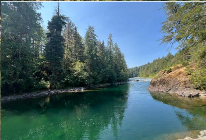
Stamp River (north)