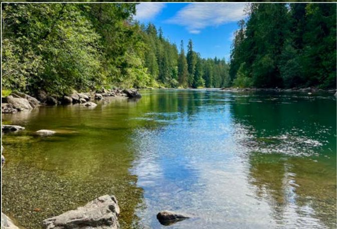
Stamp River (south)

// The region is characterized by its mix of agricultural lands, forests, and residential properties, offering a tranquil lifestyle amidst a picturesque landscape.