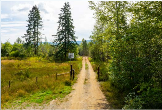
Main entrance to property